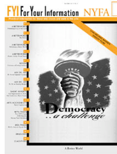
Fall 2001, Vol. 17, No. 3 A Better World

Once you go to clearance, you drive over the bridge and you park your car. Then